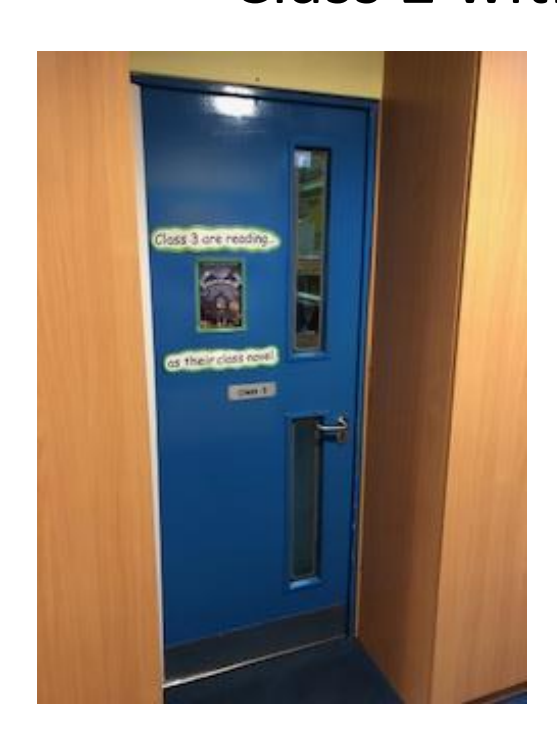
And Class 3.